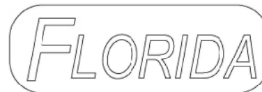
FIGURE 3—FLORIDA LOGO